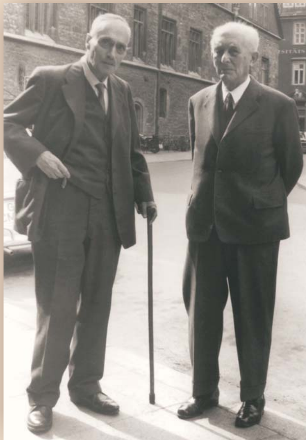
Figure 4. James Franck and Max Born in May 1964, during Franck’s last visit to Göttingen. The camera catches Franck in a characteristic gesture—pulling out his pocket watch and asking, “Do we still have time?” A few days later, he died suddenly of a heart attack.

Early in 1938 Franck accepted a position at the University of Chicago with support for his research from Samuel Fels, who had made his money in the manufacture of Fels Naptha, a popular household soap. Franck now had a group, and they did experiments on the influence of light intensity