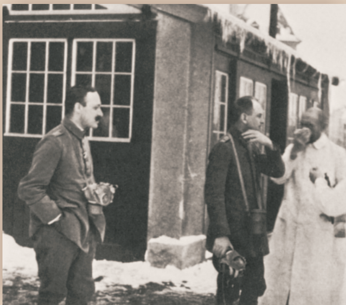
Figure 2. German army lieutenants James Franck (left) and Otto Hahn (middle) in mid-winter 1916. At Fritz Haber's institute in Berlin, they stand in front of the shack in which they test the effectiveness of masks against poison gases.

lecture while continuing his research in Berlin.